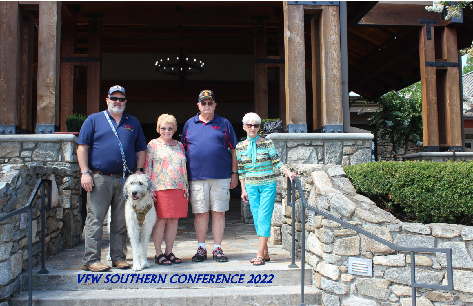
VFW SOUTHERN CONFERENCE 2022

Official Publication of the Department of North Carolina Veterans of Foreign Wars